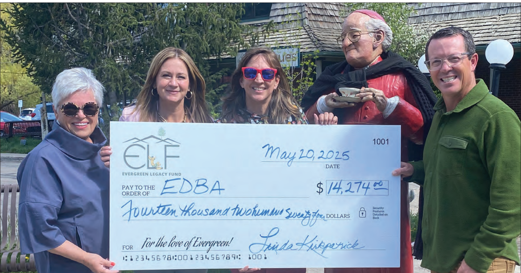
The Evergreen Downtown Business Association appealed to ELF to help with beautifying Main Street in time for the Rodeo Parade, and ELF purchased 26 planters.

A Visionary Idea in 2010 Evolves into a Community Foundation in 2025