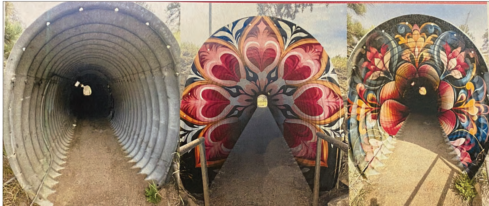
The little-known 100-year-old tunnel beneath Hwy. 74 connecting Church of the Transfiguration with Center Stage needed freshening up, and ELF provided $3,000 with a challenge for others to help with donations to paint a 40-foot mural and install better lighting.