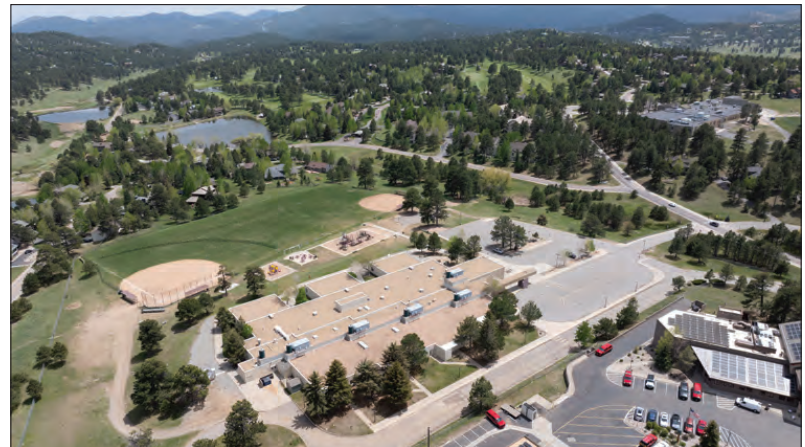
After the closure of Bergen Meadow Elementary School in May of 2024, ELF took the lead in coordinating ideas for a proposal to the school district for the creation of affordable senior housing and retention of the athletic fields as well as reserving a building pad for a community center. ELF serves as a convener, bringing people together to make create improvements. It does not own or maintain the projects it helps make possible.