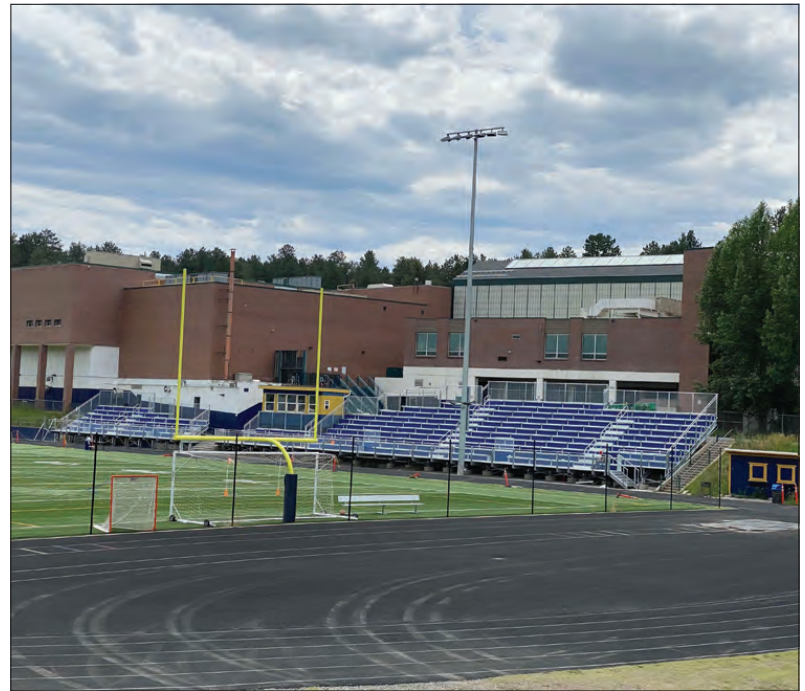
When the Evergreen High School Parent-Teacher-Student Association kicked off a campaign to raise money to acquire bleachers, ELF issued a $5,000 challenge grant to get them started.